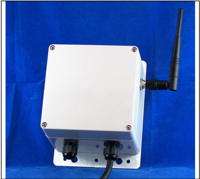
Dimensions (with mounting plate) 6.3" L x 4.8" W x 4.3" H